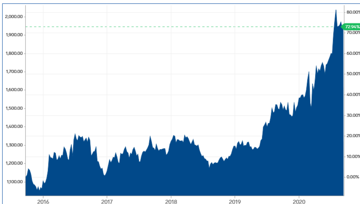
Figure 2: Five-year gold price chart, courtesy of Markets Insider

Gold's ascent began five years ago, with interest rates low and question marks beginning to be asked about the world economy. Interest rates were kept low during and subsequent to the GFC, as a means of accelerating and maintaining economic growth, but have never been allowed to return to 'normalised' levels. There are inherent dangers in keeping interest rates too low for too long, as they have created asset bubbles and led to artificially high equity markets. Furthermore, central banks have left themselves very little wriggle room to manoeuvre in terms of interest rates, which are already at historically-low levels.